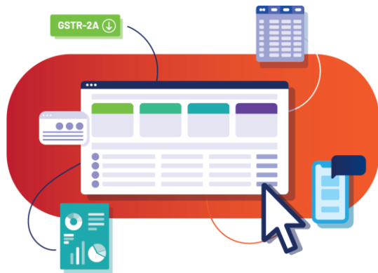
GSTR and ITC Recon